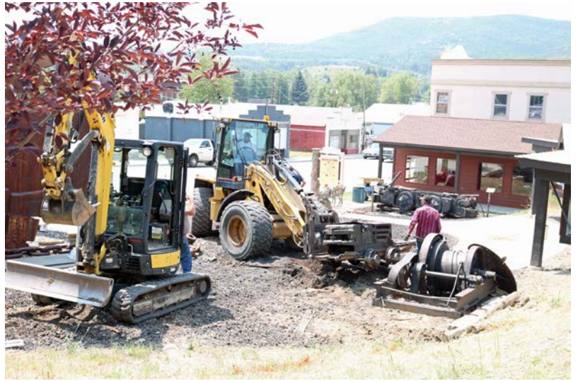
2018 Photos: Moving equipment, dirt and finished retaining wall.